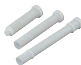
5", 7", 10" diffuser tubes