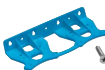
-D- wall bracket