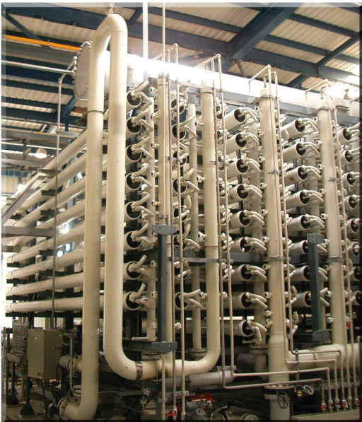
SWC membrane installation, 45 MGD (170,000 m 3 /d) in Fujairah, U.A.E.